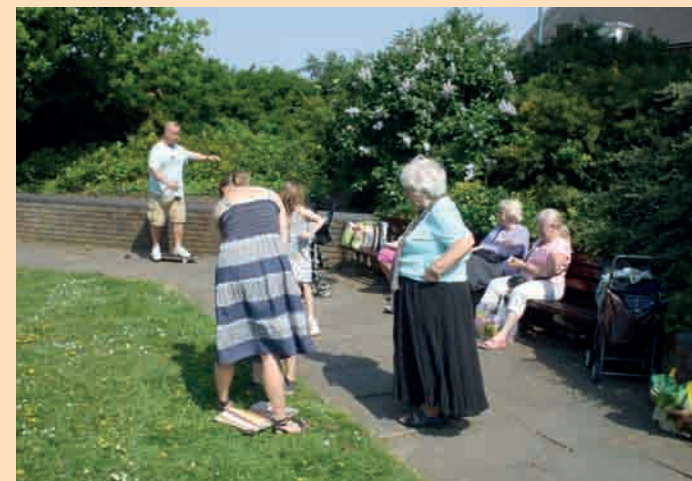
Residents enjoying the Gardens

On 1st June the FORGE Chairman and Secretary met with the London