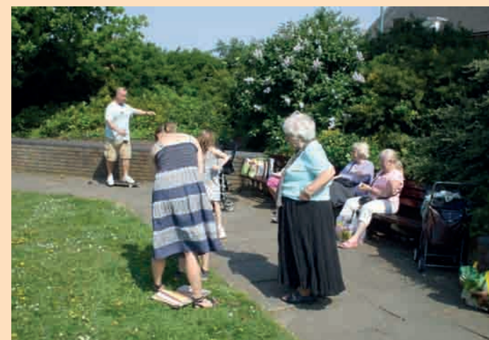
Residents enjoying the Gardens

On 1st June the FORGE Chairman and Secretary met with the London